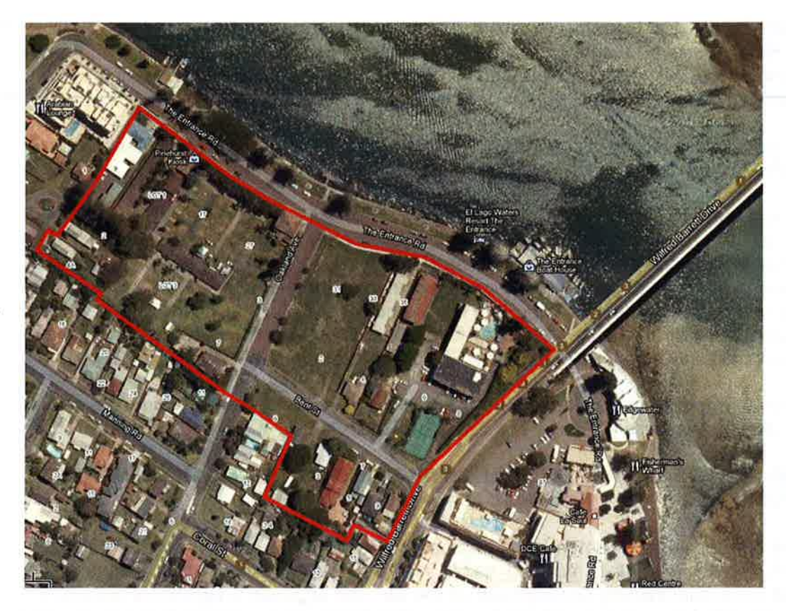
Figure 1: Site Plan.

The amendments aim to achieve the same outcomes proposed in relation to 'Key (Iconic) Development Sites' in the Composite LEP, presently awaiting S64 consideration.