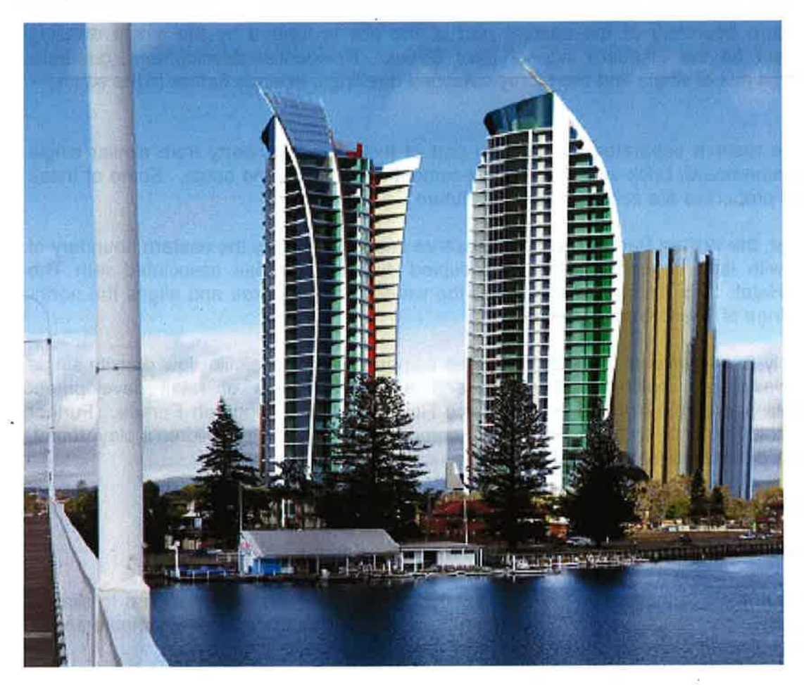
Figure 4: Artist's Impression of the Proposed Future Development, when viewed from The Entrance Bridge.